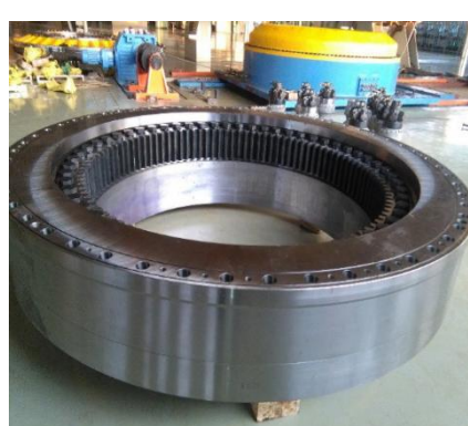
Fig.2. Main bearing in TBM