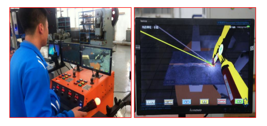
Fig .7. Virtual Welding Training Teaching System( Based on Virtual Reality)