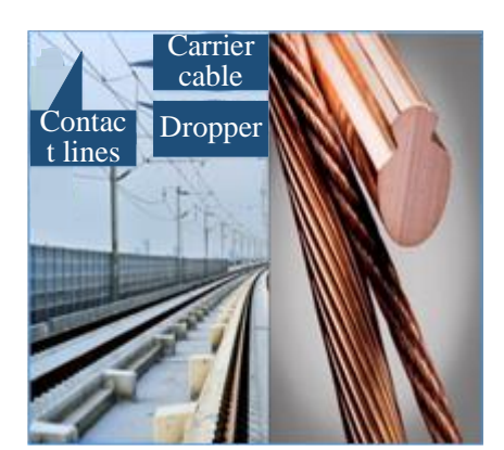
Fig .3. Bionic functional surfaces manufacturing Fig .4. High-speed railway contact lines