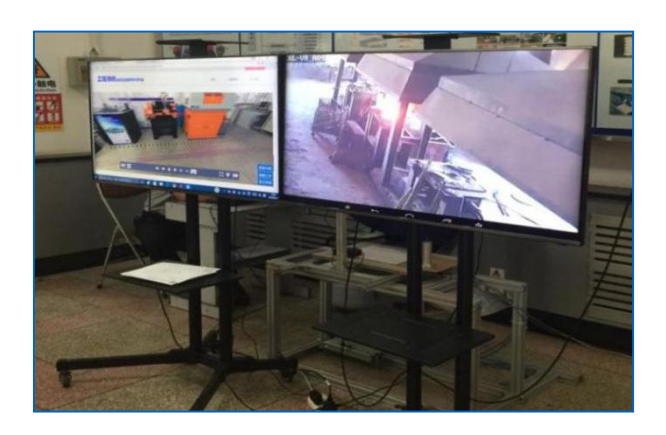
Fig .6. Real - time distance transmission teaching system of mold casting